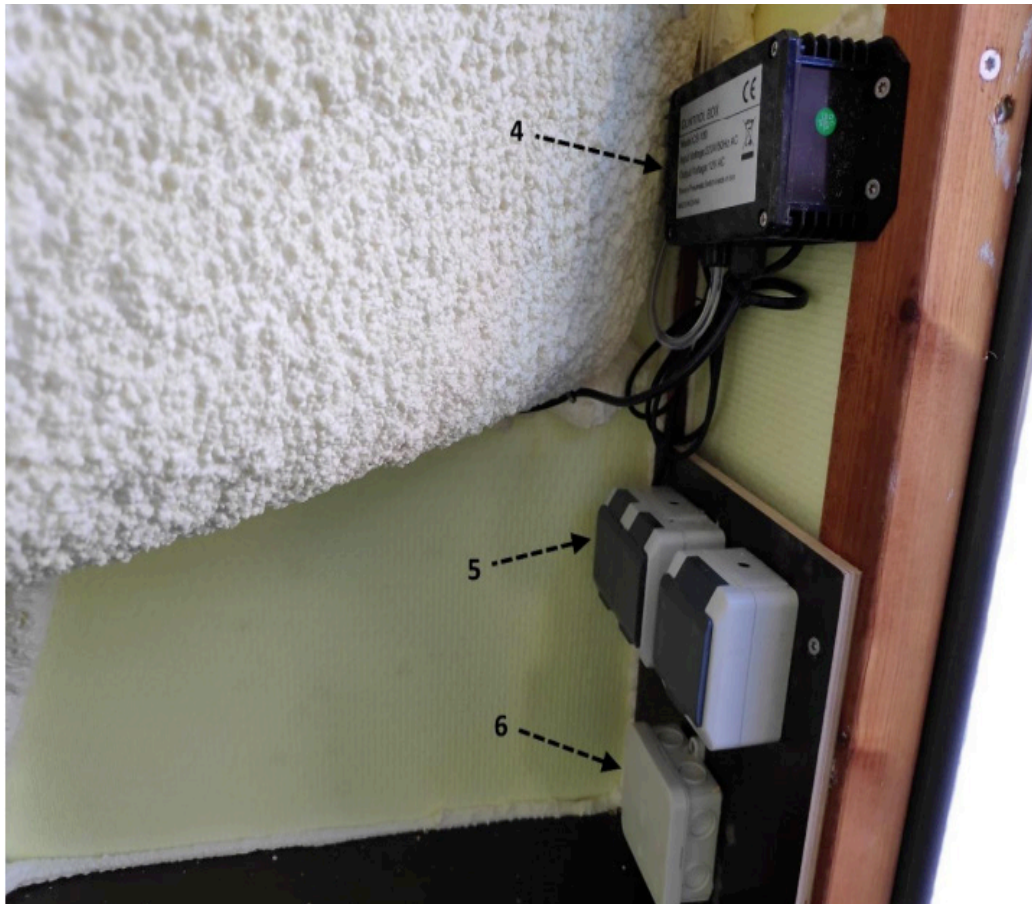
Figure 5. Contents of the equipment cabinet

The power supply to the equipment cabinet as shown in Figure 5 must be provided by a qualified electrician. The electrical part of the installation must be carried out in accordance with the applicable regulations and standards.