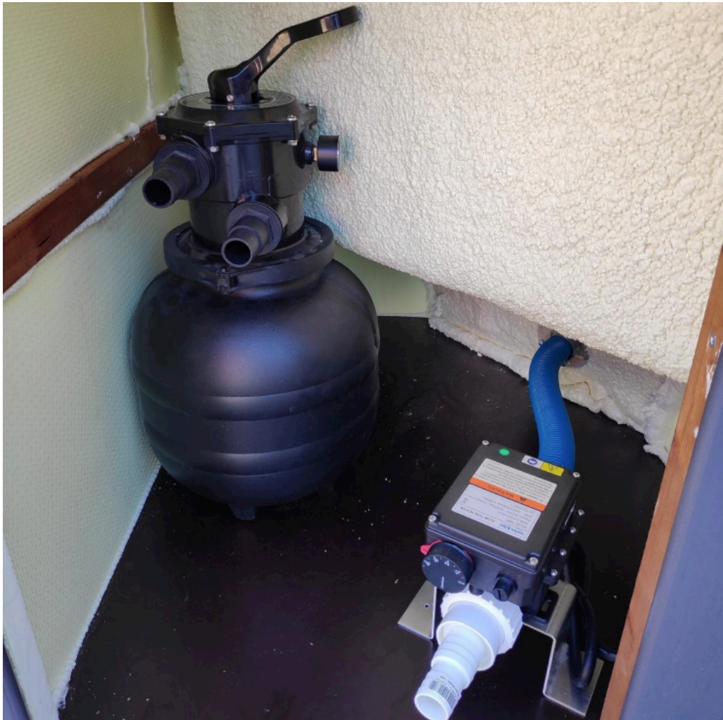
Figure 8: Installing the pumping system

4. Install the pumping system in the equipment cabinet according to figure 8. When installing the pumping system, refer to the pumping system manual.