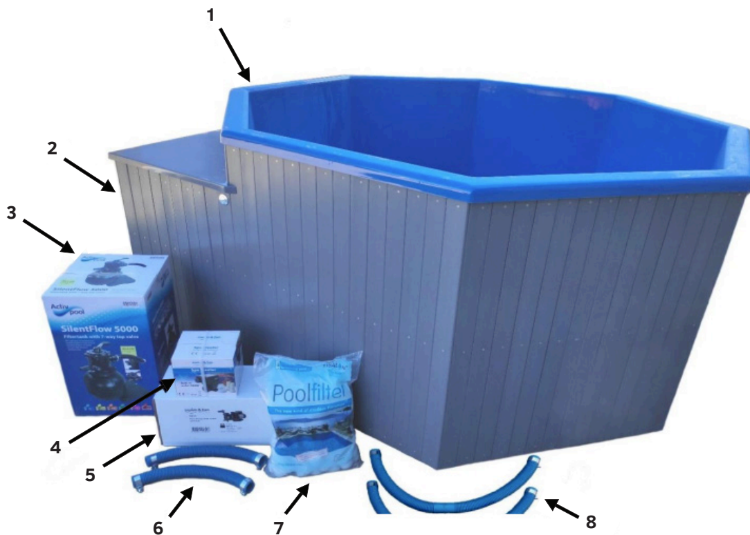
Figure 1: Package contents