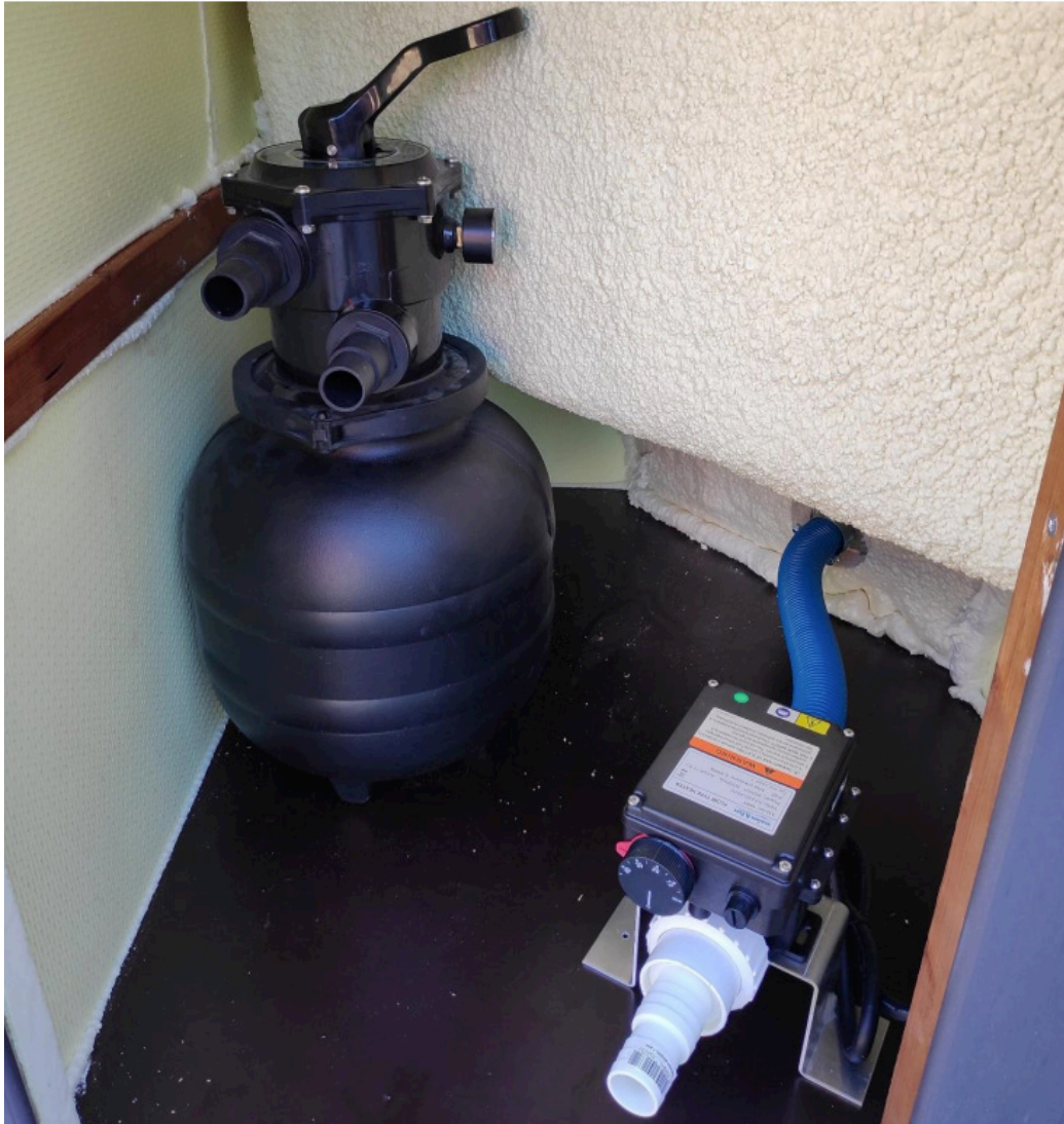
Figure 7: Mounting the electric heater