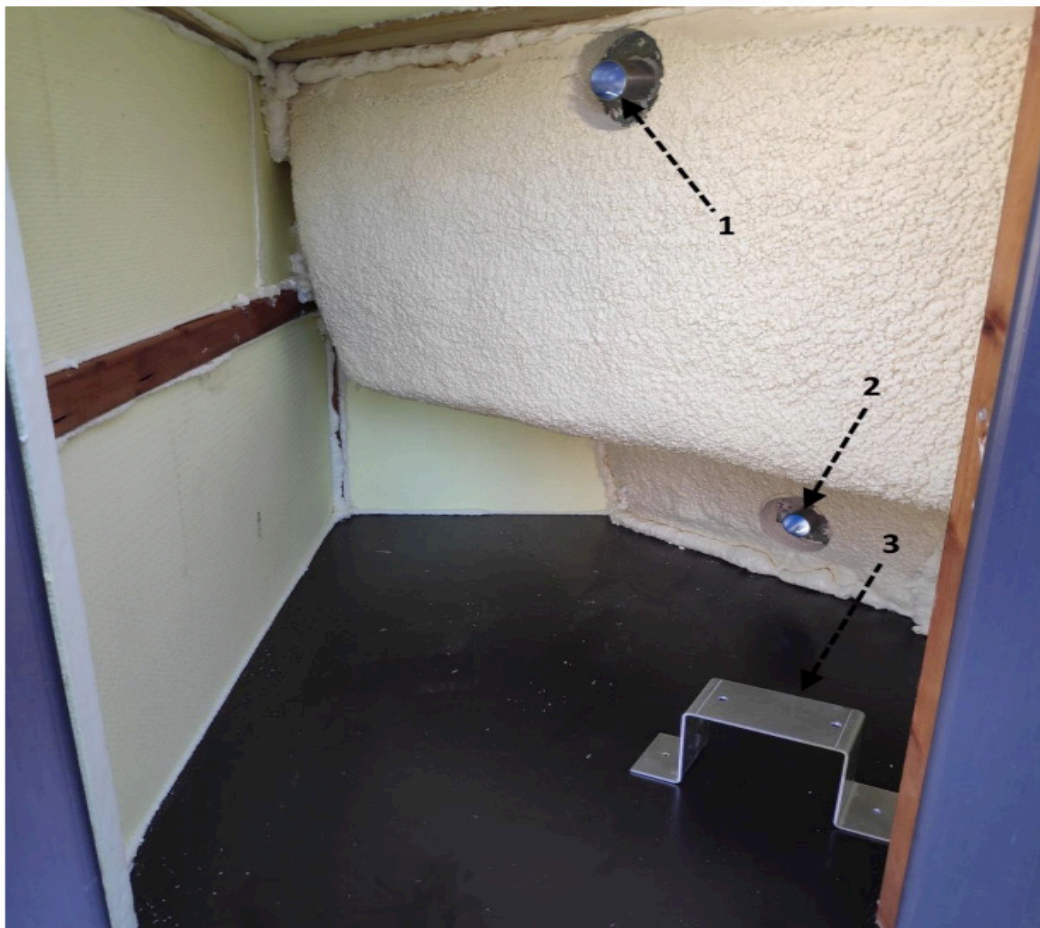
Figure 4. Contents of the equipment cabinet