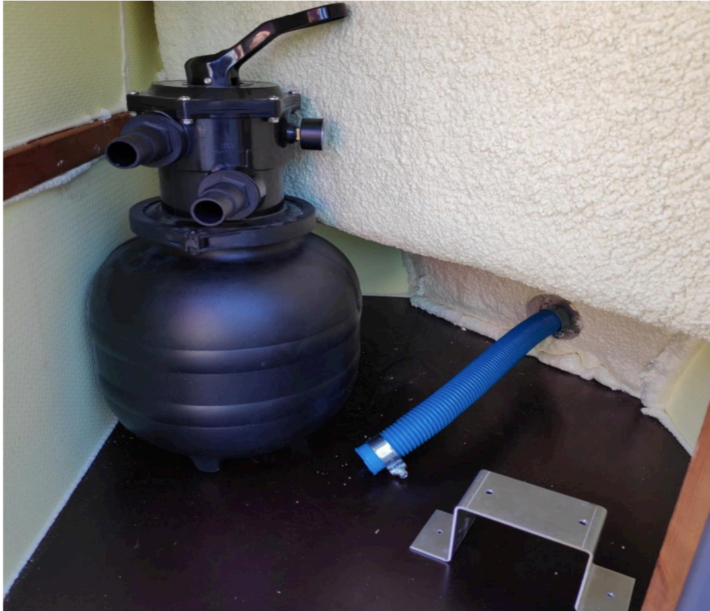
Figure 6: Mounting the short hose and filtersystem