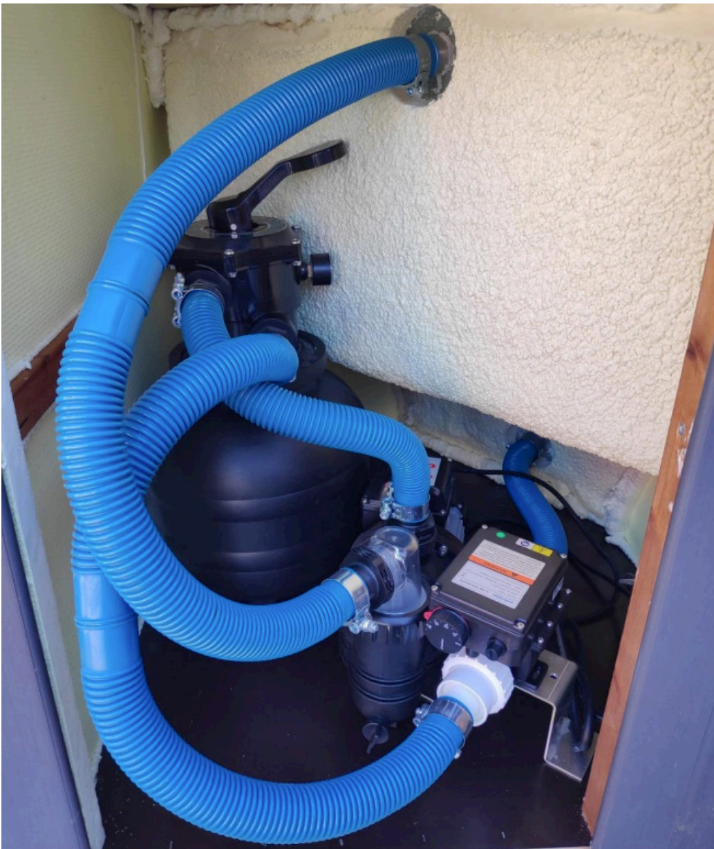
Figure 9: Mounting the hoses